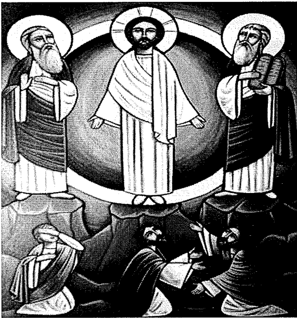
WEEKDAYS AND HOLY DAYS: AS SCHEDULED IN THE WEEKLY BULLETIN